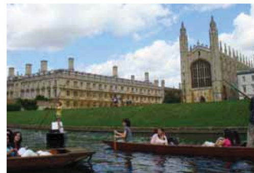
Punting on the River Cam